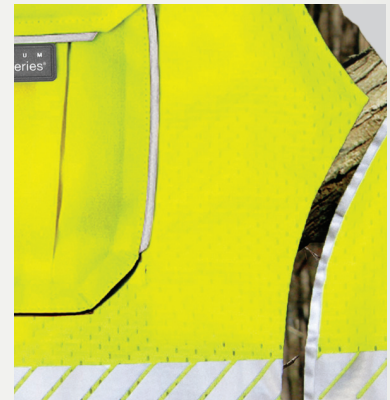
Brilliant Series reflective trim.