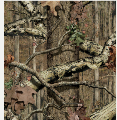
Break-Up Infinity pattern.