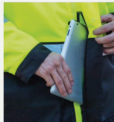
Hidden tablet pocket.